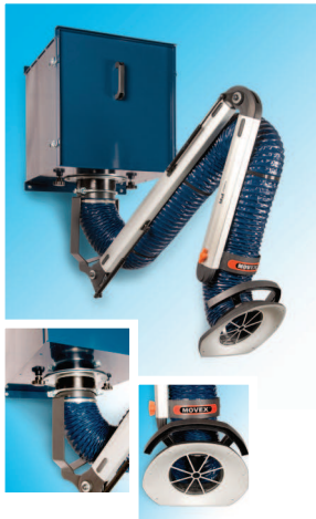
VF 2000 / VF 3000